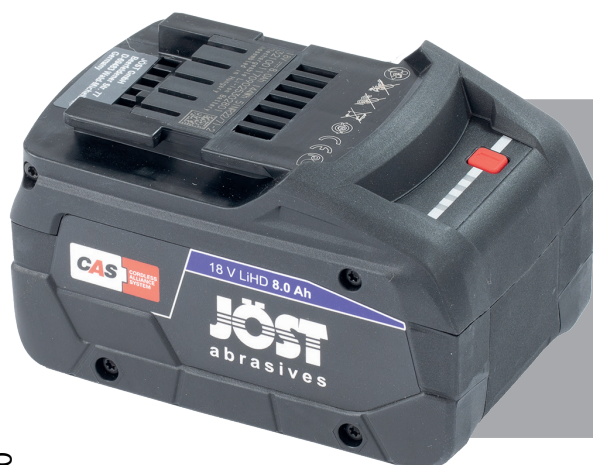
Floor Cleaner Junior 18 FCJ-18