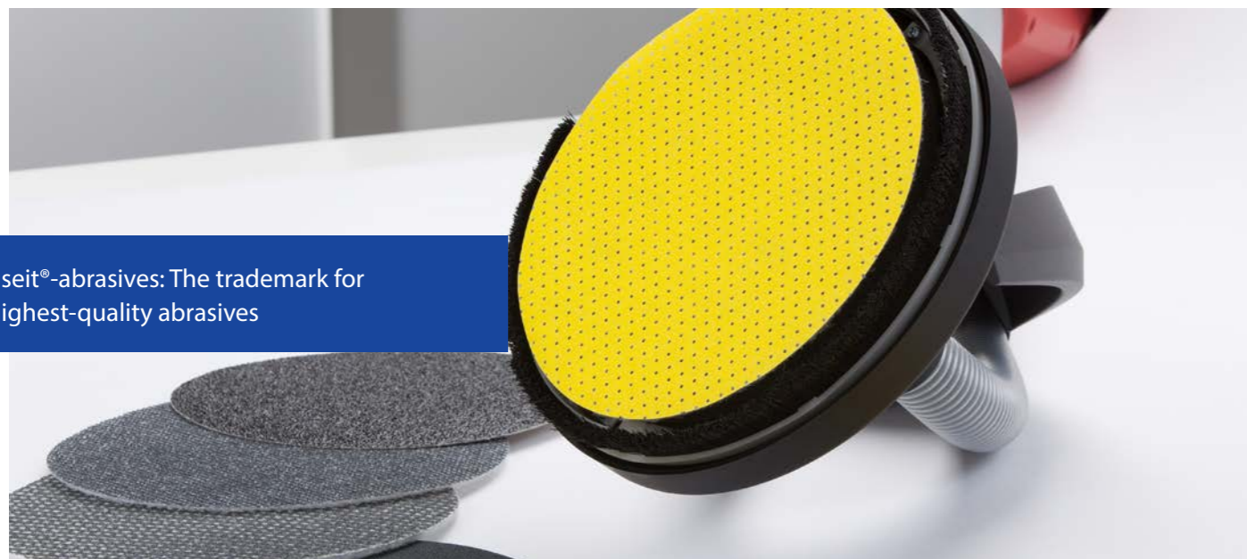
useit ® -abrasives: The trademark for highest-quality abrasives

useit ® products have a sanding performance that is up to four times better than conventional perforated abrasives. This optimizes costs and sanding time and enables effective working. In contrast to conventionally perforated abrasives, Jöst abrasives adjust the ratio of the perforation to the surface to be sanded, depending on the material and the amount of dust.